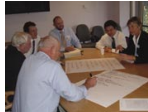
From the Worker Engagement Conference in London