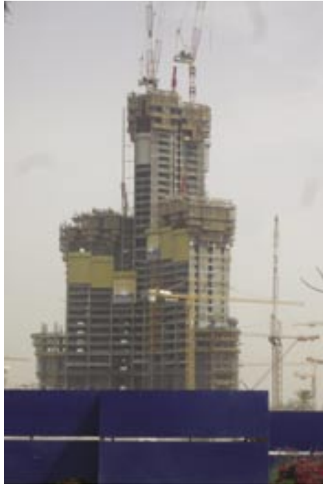
Burj Dubai, the world's highest building under construction

A new report, "Icons of Imagineered Urbanism: Real Estate Development in the Gulf with a Focus on Dubai" was released by Arab Advisors Group's Financial Markets Research division on August 27, 2006. This report can be purchased from the Arab Advisors Group for only US$ 1500. The 50-page report has 29 detailed exhibits and 29 figures and pictures. The report presents a thorough overview of the outstanding urban development in progress in Dubai and all the main mega projects in the city-state. The report further profiles all the major players in the market including Emaar, United Development Company, Gulf Finance House and Kuwait Finance House - Bahrain. Moreover, the report highlights developments in other cities in the Gulf such as Abu Dhabi, Doha, and Manama.