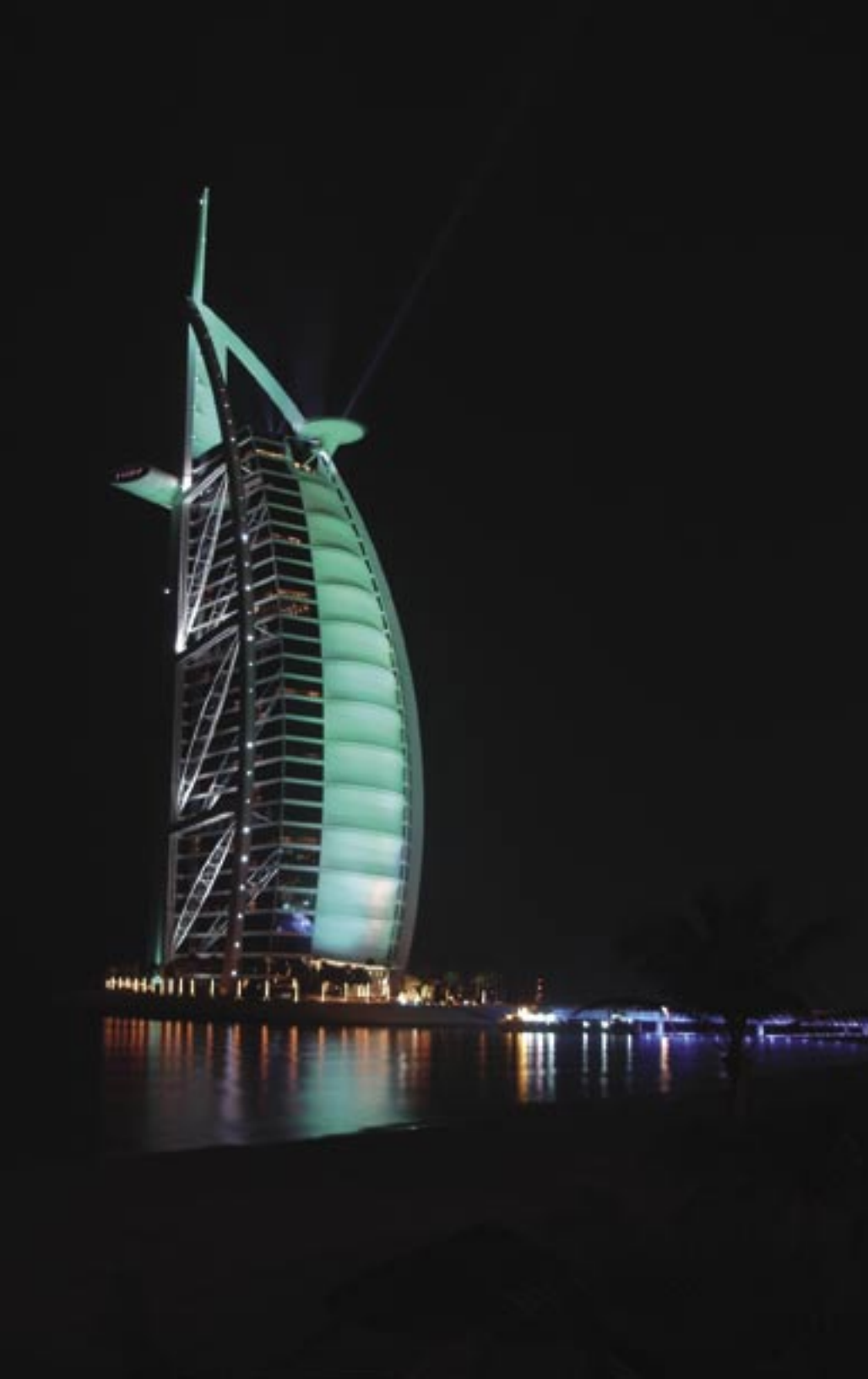
left: Burj al-Arab, the world's tallest hotel

"The challenge for Dubai and the UAE is to retain their attractiveness for investors and expatriate residents as not just an attractive place to live and work, but also as a cost-effective location. The Dubai municipality is planning for a population of 5 million by 2020 compared to the present 1.2 million. While an official cap on rent increases to 15 per cent has been imposed until the end of 2006 to reduce the frenzy, the growth of rents became a big concern in 2005. As in Qatar, there are expectations that the vast real estate developments under way will lead to a more stable real estate market." Dr. Bagaeen concluded.