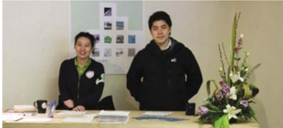
Students of Mackintosh School of Architecture at the consultation event

A collaborative Urban Design project between the Mackintosh School of Architecture and Helensburgh Community Council.