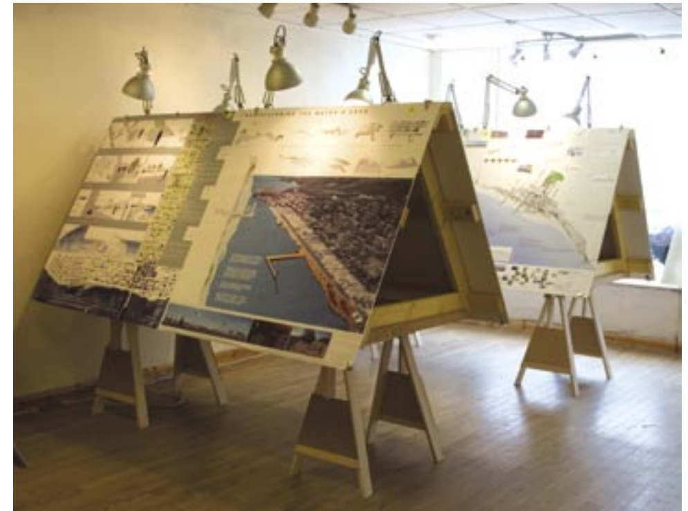
Students' projects for regeneration of Helensburgh

The students were organised into twelve, self selected teams of six and were set the task of interpreting the town, formulating ideas for design development and finally presenting them for public exhibition. Student led research into the town was conducted on a team by team basis and was necessarily limited due to the restricted timescale of the project. This, however, encouraged the teams to take a broad overview of the urban construct of Helensburgh, allowing them to target a