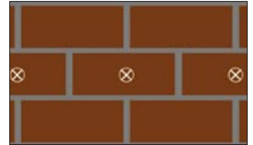
The Anti-Damp-Nozzle-Nub™ inserts, which are 22mm (nominal diameter) by 85mm long, are placed in the holes drilled into the bricks.