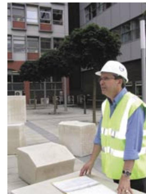
Sustainable materials at the conference venue

For further information, including details regarding submissions and registration, please visit: